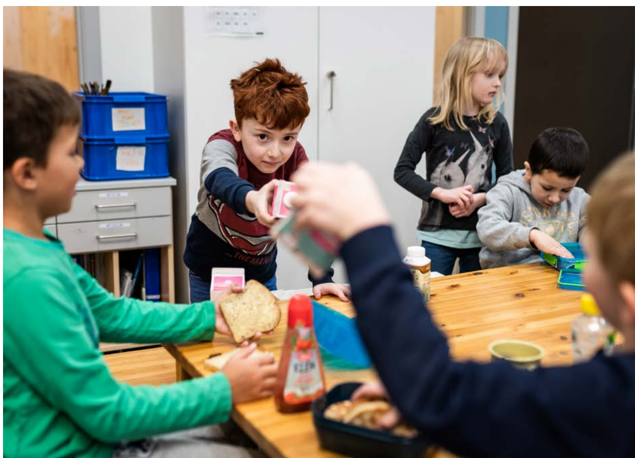
Lenangen school is financed with KBN's green lending rate.

Kommunalbanken AS (KBN) is the Norwegian state agency for local government funding. KBN is 100 per cent owned by the Kingdom of Norway (AAA/Aaa) and managed in accordance with the Central Government Maintenance Statement.